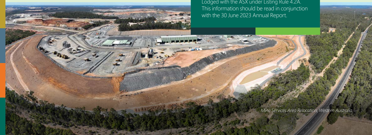
Mine Services Area Relocation, Western Australia

Lycopodium Limited Level 5, 1 Adelaide Terrace East Perth, Western Australia 6004