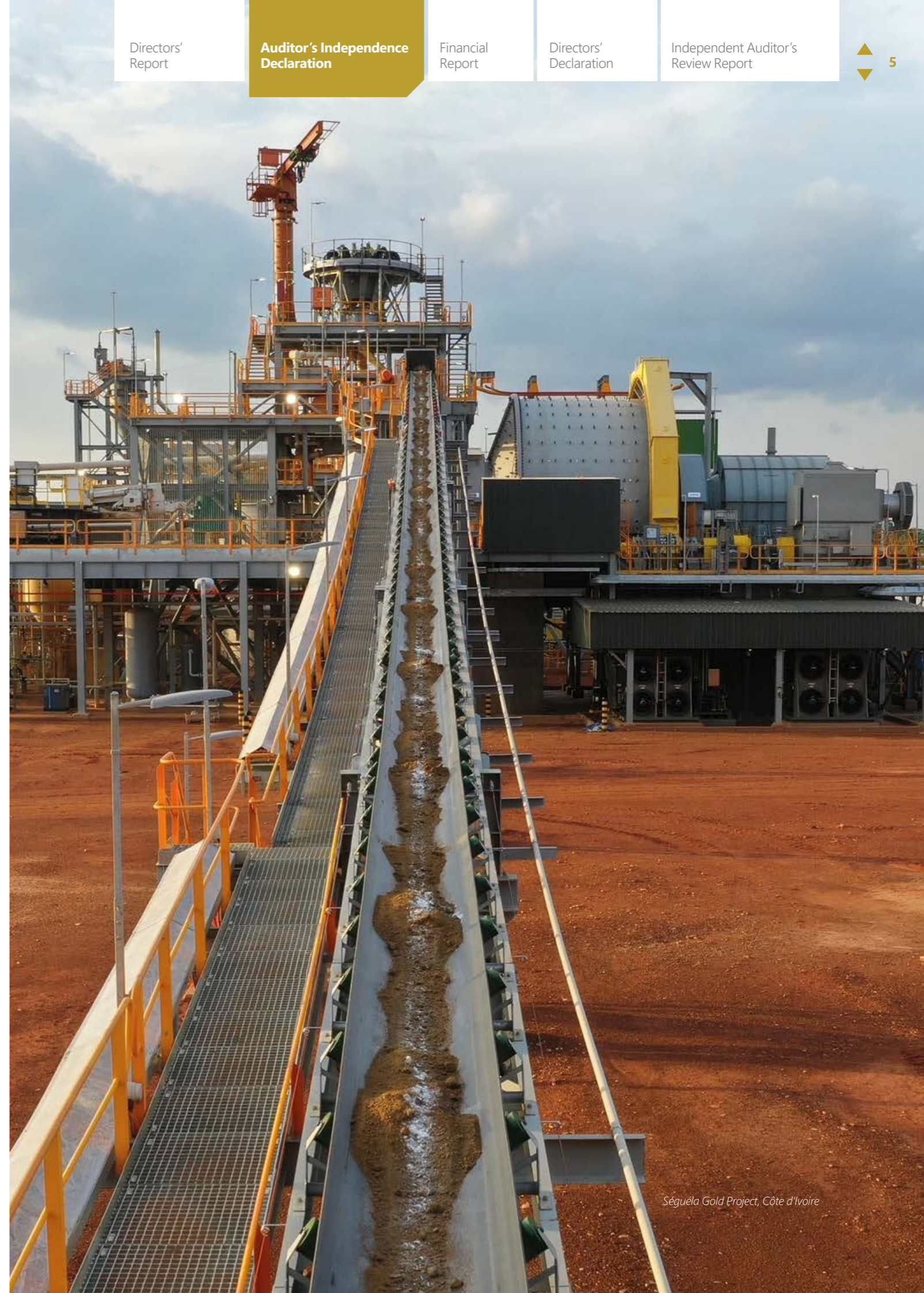
Séguéla Gold Project, Côte d'Ivoire

RSM Australia Partners is a member of the RSM network and trades as RSM. RSM is the trading name used by the members of the RSM network. Each member of the RSM network is an independent accounting and consulting firm which practices in its own right. The RSM network is not itself a separate legal entity in any jurisdiction. RSM Australia Partners ABN 36 965 185 036 Liability limited by a scheme approved under Professional Standards Legislation