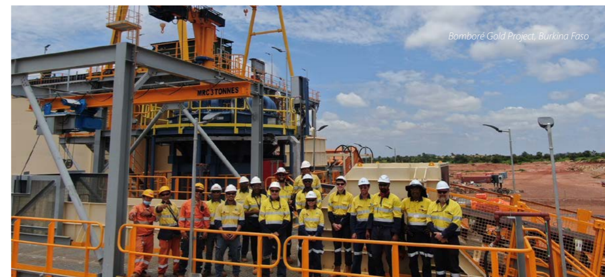
Bomboré Gold Project, Burkina Faso